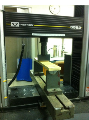
5582 Instron machine