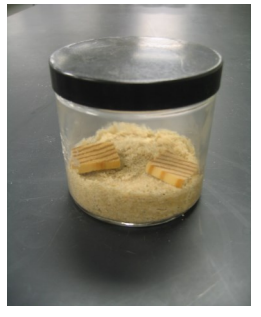
Termite jar test