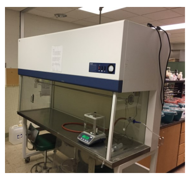
Laminar Flow Hood